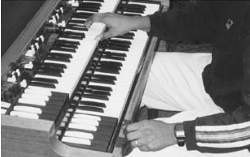
Fig. 35. Leslie speed switching with the left hand

In this exercise, play the tune with your right hand on the upper manual and your left hand on the lower manual. Switch the Leslie speed when indicated by the "X" in the music on the following page. Begin with the Leslie on the SLOW, or "chorale," setting. If you have a speed switch on your instrument, it is most likely located near your left hand. If you have a foot switch to control the speed, use your left foot. Switch speeds as quickly as possible with your left hand. It's okay to take your hand off the keys for a second.