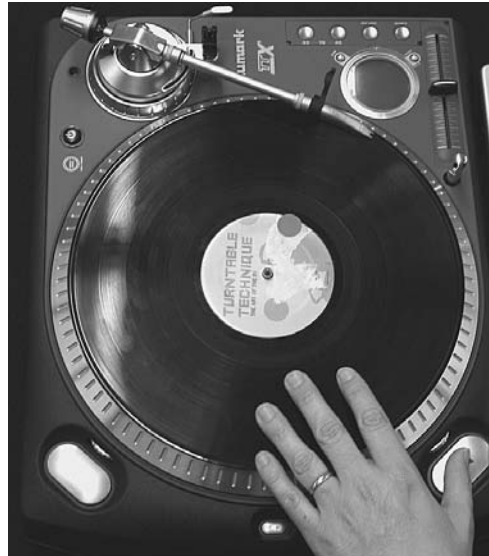
Fig. 5.1. Starting the platter while holding the record

If you miss, you can just let the record on your right keep playing, backspin the record on your left to the top, and try setting it in motion again. You may have to try this several times before you get the two records in perfect sync.