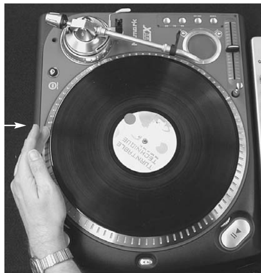
Fig. 5.3. Dragging the platter

Get on in there and spin and drag up a storm until you've gotten the hang of it. Once you get comfortable with these techniques, beat matching becomes a breeze.