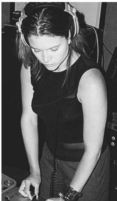
Fig. 5.4. Cueing with headphones, one ear off

If you are matching the beat of the record in your headphones to a record that's playing over the sound system, slide one ear out of the headphones as you cue it up, so you can hear both records. There are headphones made just for DJs that have only one earpiece.